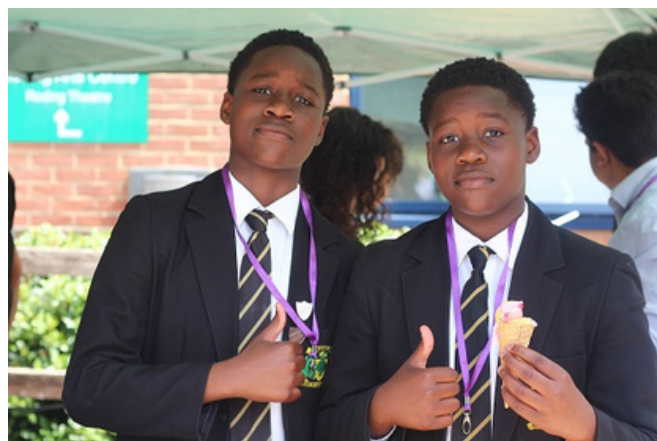
Selling At The Enterprise Fair

I am immensely proud of what we have accomplished as a team. Our story is proof that with the right mindset and determination, success is achievable.