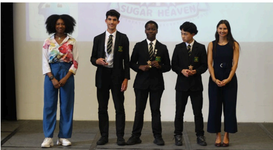
Winning Group - Sugar Rush

I prepared a comprehensive PowerPoint presentation that highlighted every aspect of our business, from inception to the financial results. We included data, charts and testimonials to make our presentation compelling and informative. The goal was to not only present our success but also to inspire others with our journey. The presentation was a huge success. The audience was impressed by our achievements, and the feedback was incredibly positive.