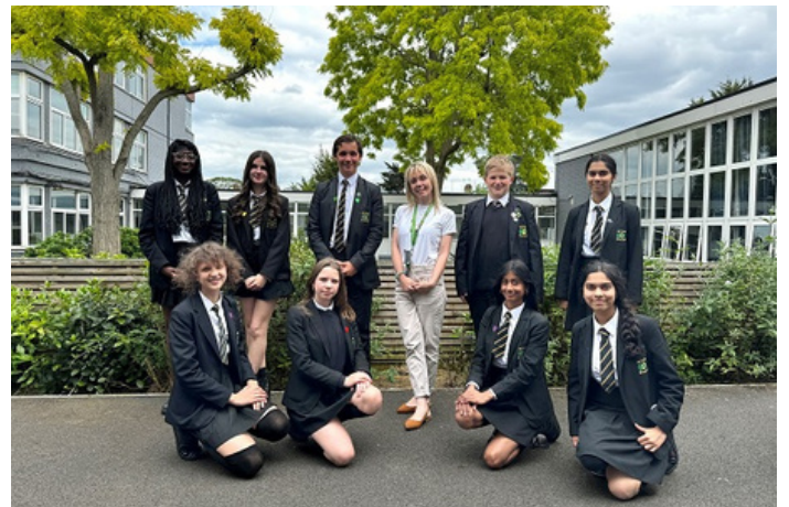
New House Captains

Our new captains have already hit the ground running, actively participating in and organising various events. Keep up the great work, House captains!