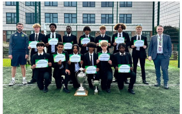
Year 10 Football Team

Y10 Boys Football Team are also the Essex Champions. They played 6 games against a range of schools across Essex. There were a total of 26 goals scored and only 5 conceded in these games. The sixth game was the final against Great Baddow High School that was played at Aveley stadium, which they won 2-1. This is an amazing success and they should all be proud of their achievements this year, well done!