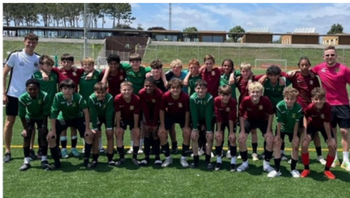
Spain Sports Tour