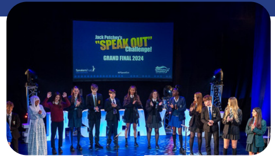
Speak Out Grand Final

are very proud of our Regional Finalist for having the courage to perform her speech twice on a main stage. Impressive work!