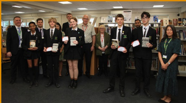
Year 10 awardees