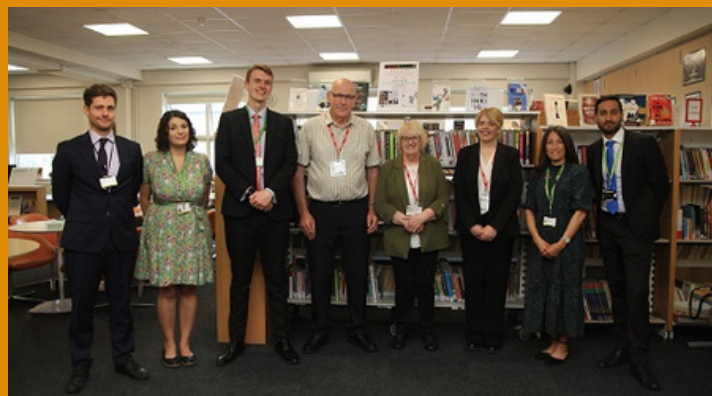
The Whelan family with the History Department