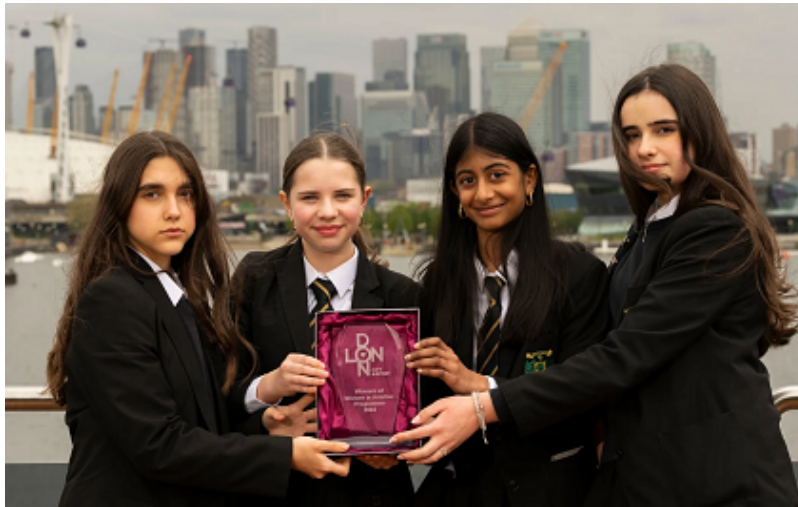
Winners of 'Women In Aviation'

Woodbridge students won London City Airport's Women in Aviation programme after taking part in a sustainability challenge!