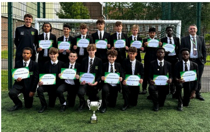
Year 9 Football Team

Y9 Boys Football Team are now the 2023/2024 Redbridge Champions. All schools in Redbridge are put in to 4 groups. They then progress on to a quarter final, semi-final and then final stage. Year 9 Boys faced Oaks Park in the final and won 6-0! Overall in the season the Year 9 team scored a huge amount of 20 goals and conceded 7. A huge congratulations to these students.