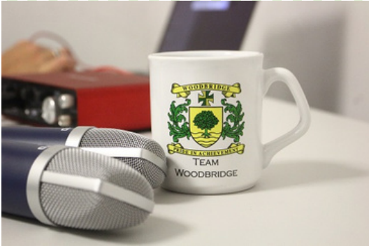
Stay tuned for our podcast!