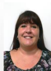
Ms Board Wellbeing Officer