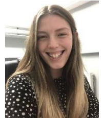
Ms Able Trainee Psychotherapist

Serious matters can include physical, emotional or sexual abuse, neglect, serious bullying, drug or alcohol abuse, being forced to follow a religion, female genital mutilation, forced marriage, gang involvement, mental health issues, radicalisation, sexual exploitation, sexting and teenage relationship abuse.